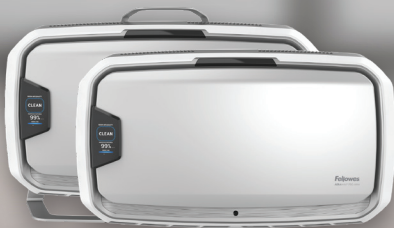
AeraMax Pro AM4 Series purifies 650-1,100 Square Feet