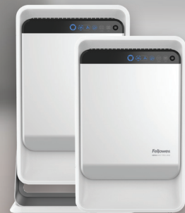
AeraMax Pro AM2 purifies 150-250 Square Feet