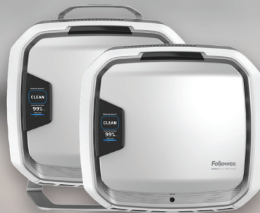
AeraMax Pro AM3 Series purifies 300-550 Square Feet